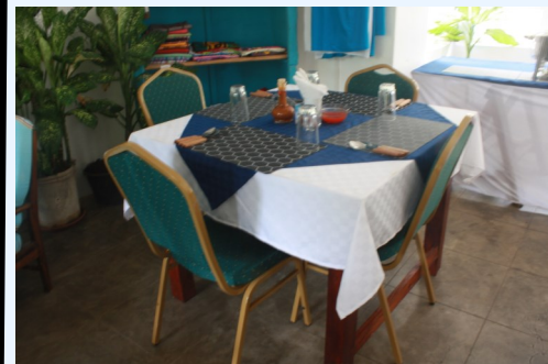
Our Mwamba Restaurant