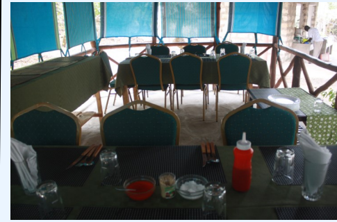
One of our outdoor Bandas, we call it 'The Sarova Stanley'