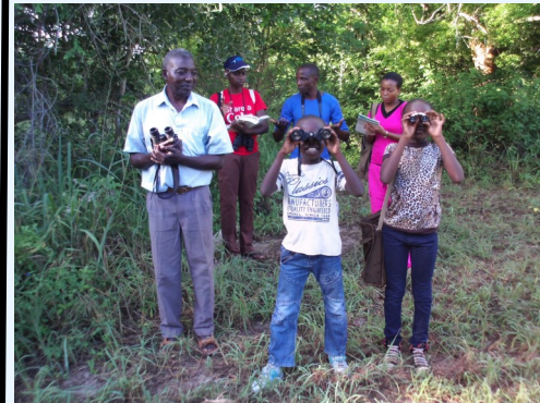
Bird watching in Arabuko Sokoke Forest during a nature walk