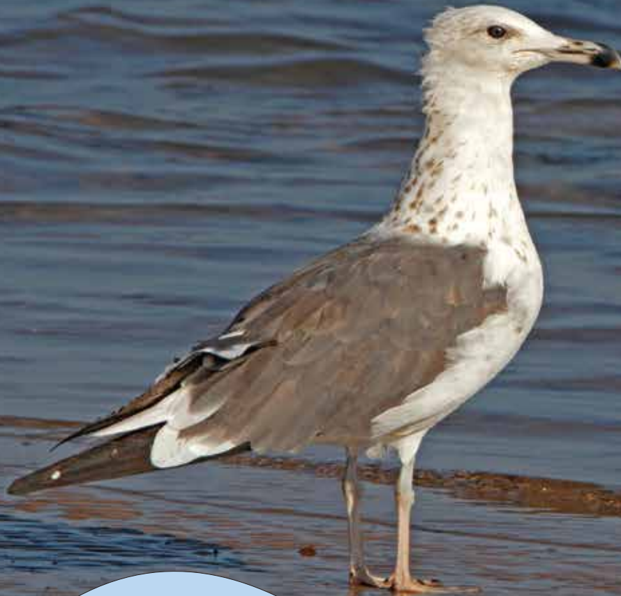
Lesser Black Backed Gull

In January we reported on the start of the Kenya Bird Map an ambitious project that A Rocha Kenya has been instrumental in getting started that is mapping the current distribution of Kenya's bird species and comparing it with the atlas of birds that was carried out in the late '70s and early '80s. The project has continued to grow and whilst it has been a slow start to get going, the website is now functional to the level that it is possible to upload data and already over 2,600 records from 54 cards covering 37 atlas squares (known as 'pentads' as they are 5 minutes of latitude by 5 minutes of longitude in size).