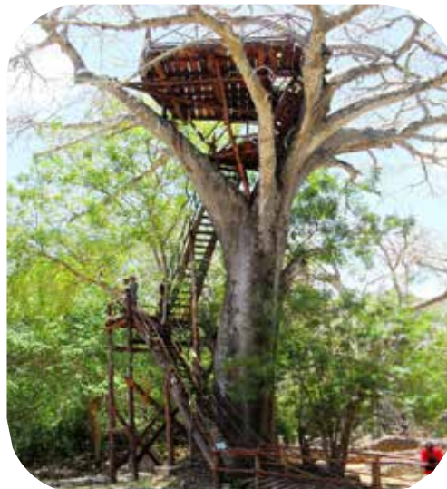
Gede Ruins Tree Platform