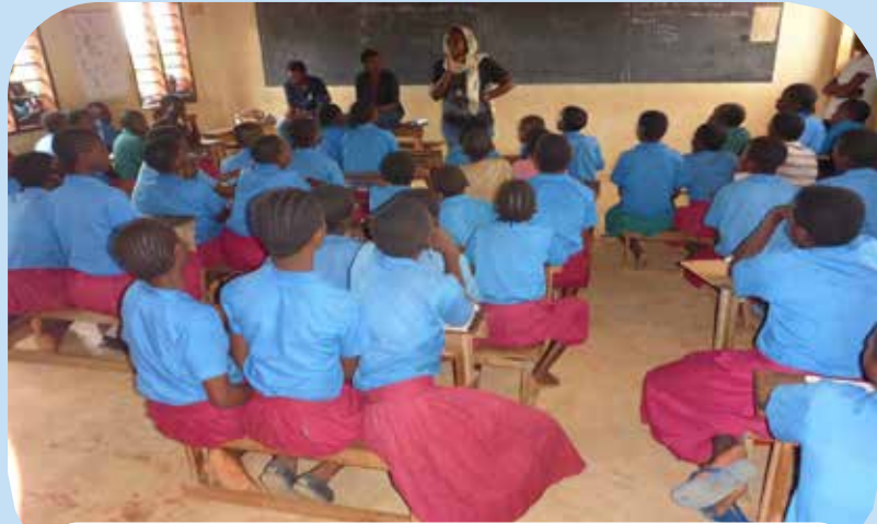
class presentation and discussion at Mekatilili School

In Watamu, The A Rocha Kenya Environmental team made a visit to Mekatilili School, with the day's environmental education theme being "ecosystem is a complex set of relationship among them living resources, habitats and residents of an area". The pupils got to learn