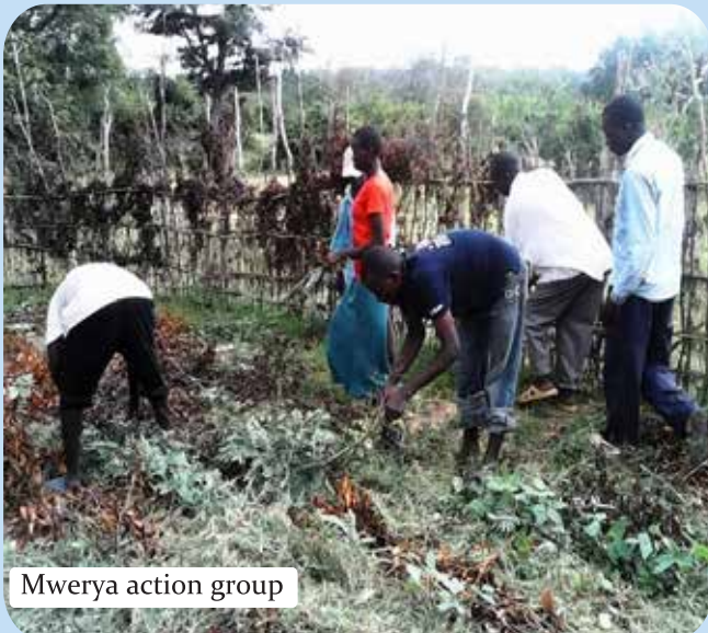
Mwerya action group