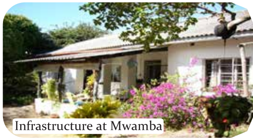
Infrastructure at Mwamba

Mwamba Field Study Centre provides simple and pleasant, friendly and relaxed full-board accommodation for all interested visitors, including researchers and conservationists, and offers opportunities for volunteers to get involved. There are facilities for small workshops and seminars. Visitors can enjoy the dazzling white sands of Watamu's world-renowned beach and National Marine Park.