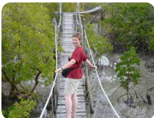
Mida creek Boardwalk

Funds collected from the amazing Mida creek boardwalk and bird hide together with the Gede Ruins tree platform are used to pay for the Scholarships offered to Children from poor families around Mida Creek and Arabuko-Sokoke Forest through the ASSETS Bursary Scheme.